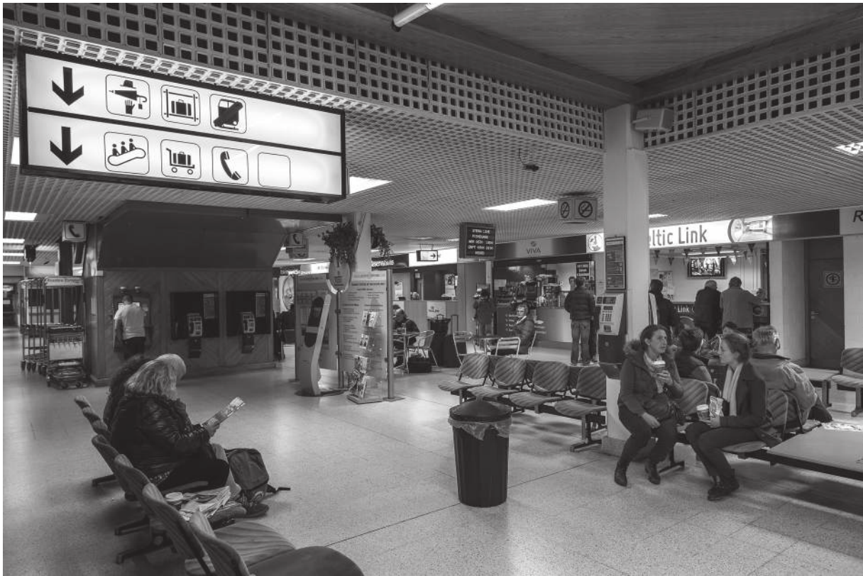
Waiting area at a ferry terminal, Rosslare, Ireland.